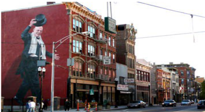
Fig. 1. Jim Tarbell mural.

Creating an opening for an alternative conception of the ethics of partnerships involving students and community members is one way to counter charges that a politically-charged community literacy project risks colonizing students and community members alike. Just as important, a convincing account of the value of such partnerships on the ground can provide some important